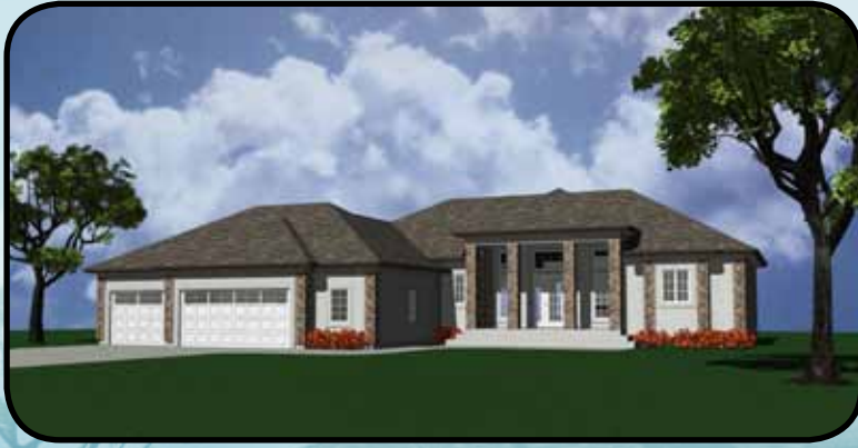
2 Tanglewood Drive "The Tanglewood"

In fall of 2011, we developed two new Master Series plans specifically for the larger lots in the golf course community of Kingswood South in La Salle. One of these homes, the Greenview at 5 Tanglewood Drive, is our newest show home to be opened for the Spring 2012 Parade of Homes and is available for viewing right now. The other, the Tanglewood at 2 Tanglewood Drive is nearing completion. At the time of printing both homes are available for sale. Ventura still has lots available in this subdivision where you can choose to build one of these beautiful homes. Some of these are forested lots backing onto the La Salle River. Contact Ron Tardiff @ 878-9585 for more information.