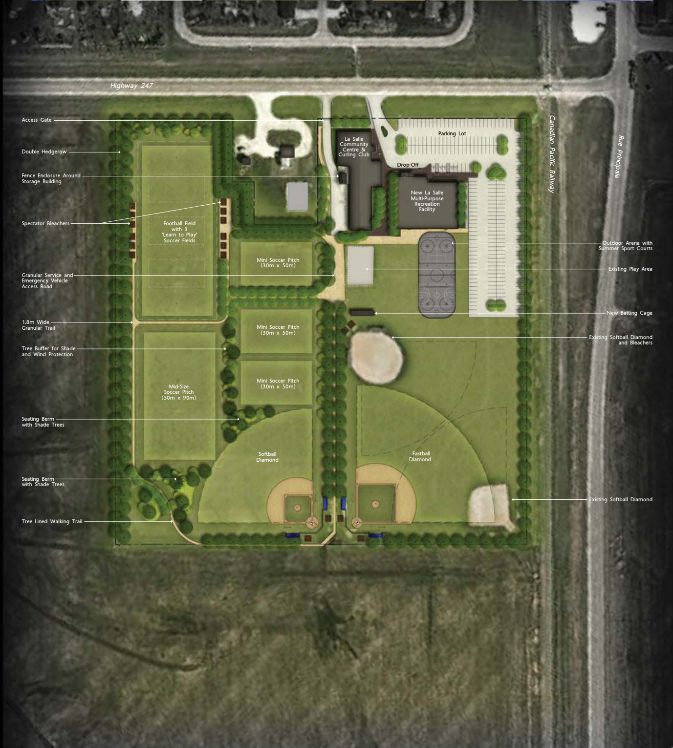
Conceptual Site Phase 1 Plan